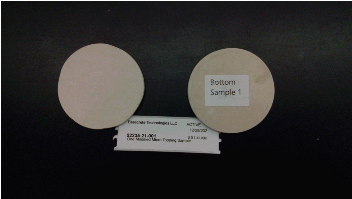
Figure 1. Login Sample Photos One Modified Micro Topping Sample