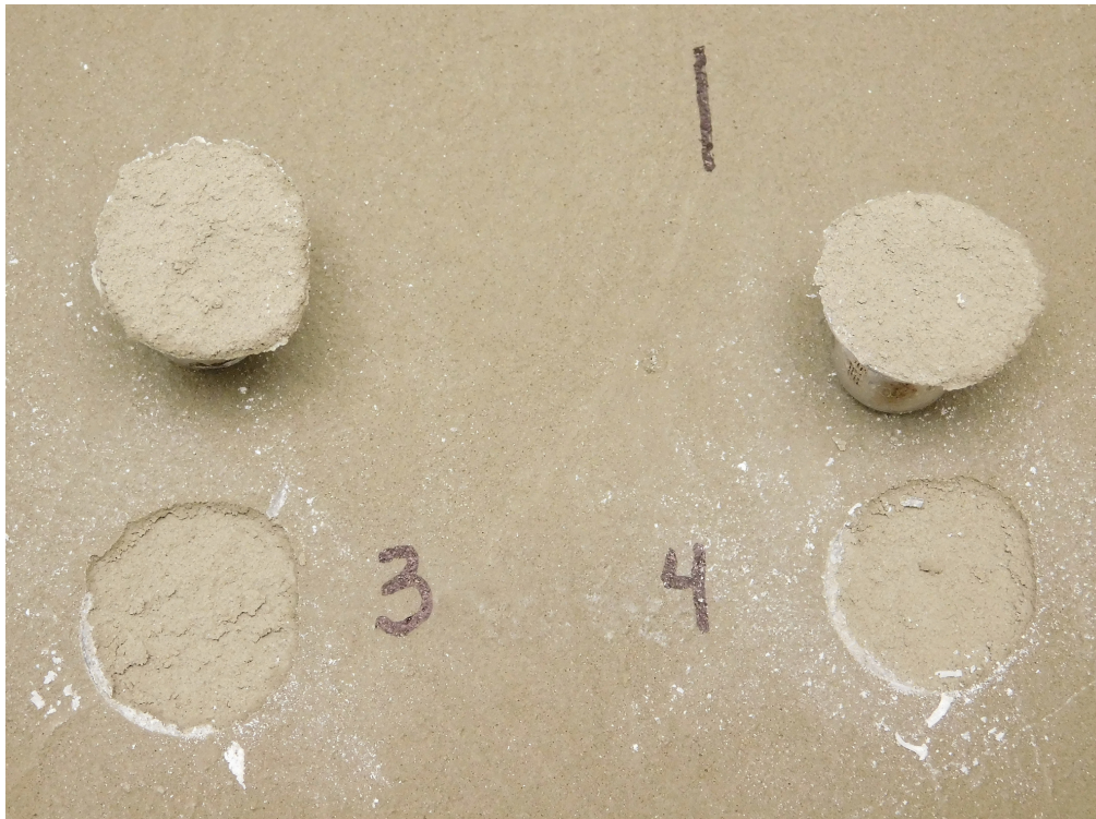
Sample 1: Two individual completed tests with corresponding dollies after pull-off adhesion – (See above)